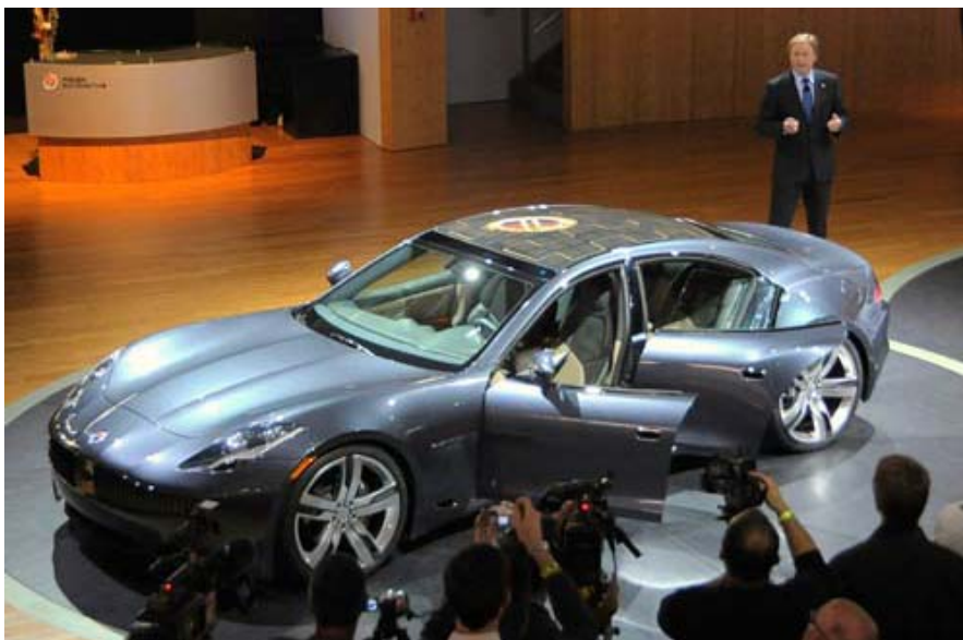
CEO Henrik Fisker unveils the Karma Premium Plug-in hybrid at the 2009 Detroit Auto Show. The Karma has an all-electric range of 50 miles, and will be available in the 3rd quarter of 2010.

Meanwhile, the 2010 Toyota Prius Plug-in Hybrid vehicle (PHV) made its North American debut at the Los Angeles show. Based on the third-generation Prius, the latest version adds a lithium-ion battery that enables all-electric operation at higher speeds and longer distances than the conventional Prius hybrid. The new Prius PHV is designed to use the all-electric mode for trips of about 13 miles. After that, it reverts to the hybrid mode like a regular Prius. Toyota plans to deliver 150 vehicles to the United States early in 2010, placing them in regional clusters for consumer tests and technical demonstrations. For instance, Toyota will place 10 Prius PHVs with residents of Boulder, Colorado, under a regional partnership with Xcel Energy's SmartGridCity program. The residents will participate in an interdisciplinary research project coordinated by the Renewable and Sustainable Energy Institute, a new joint venture between DOE's National Renewable Energy Laboratory and the University of Colorado at Boulder.